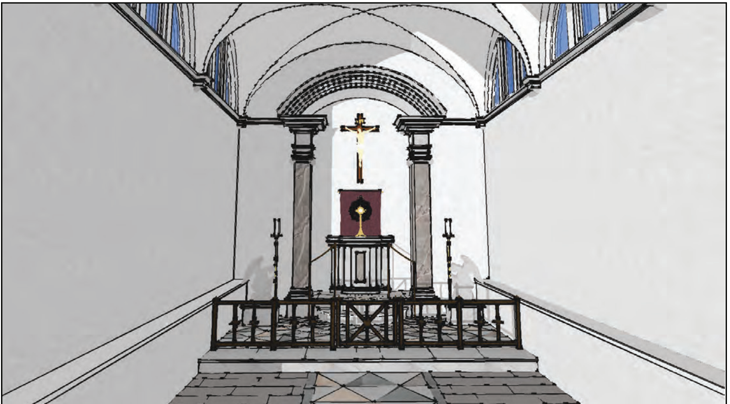
CHAPEL AT ST. LUKE THE EVANGELIST RALEIGH, NC