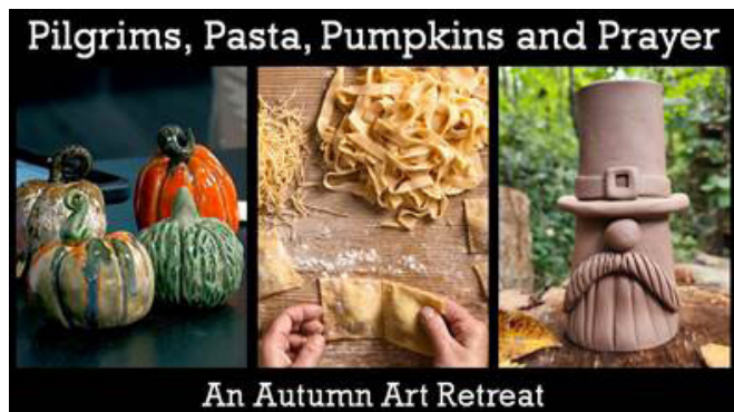
An Autumn Art Retreat