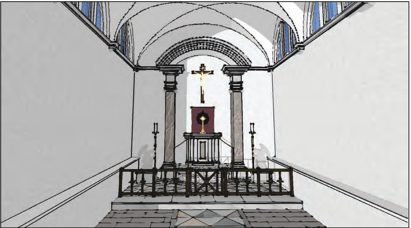
CHAPEL AT ST. LUKE THE EVANGELIST RALEIGH, NC