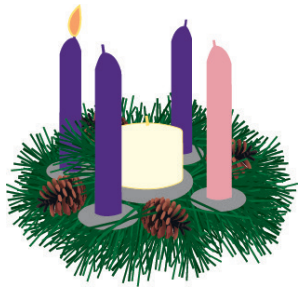
1st Week of Advent

Next Sunday: Bar 5: 1-9/Ps 126 (125): 1bc-2ab, 2cd-3, 4-5, 6 . VII/Phil 1: 4-6, 8-11/Lk 3: 1-6