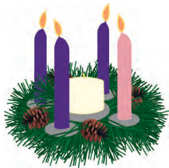
4th Week of Advent

Next Sunday: Sir 3: 2-6, 12-14/1Sm 1: 20-22, 24-28/Ps 128 (127): 1-2, 3, 4-5 . II/Col 3:12-21/Lk 2: 41-52