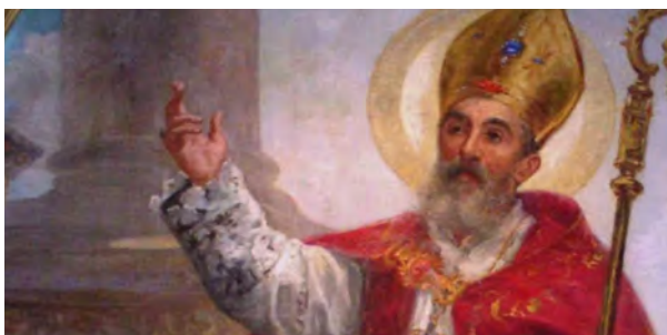
Saint Hilary of Poitiers, Bishop and Doctor January 13

After all masses this weekend, there will be a Miracles of the Eucharist Display in St. Luke's parish hall!