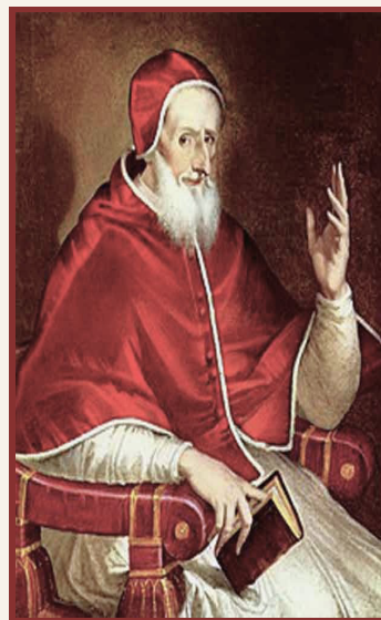
ST. PIUS V, POPE APRIL 30 TH