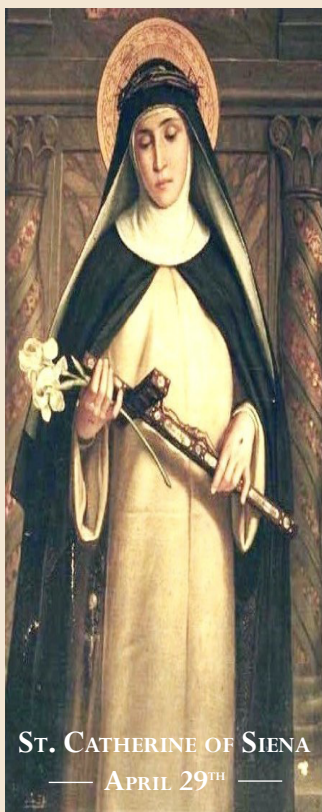
ST. CATHERINE OF SIENA — APRIL 29 TH —